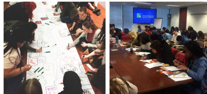
Photo Credit: Chicago Metropolitan Agency for Planning youth engagement